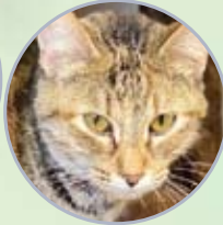
Cindy Lou Who