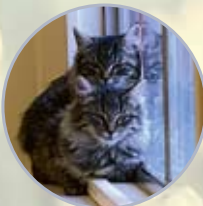
Oak & Pine